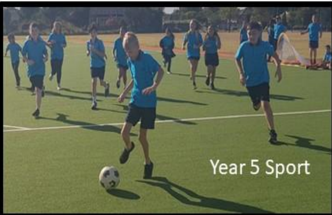
Year 5 Sport