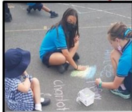
Getting to know our Buddies

Every Friday if we do not go to interschool sport we play Year 5 sport. It is fun and we get to do a lot of exercise. Some games help you with your team work and some games help you think about different strategies you can use. We play fun games like War Ball, Memory tag, and Number Soccer. I really like sport!