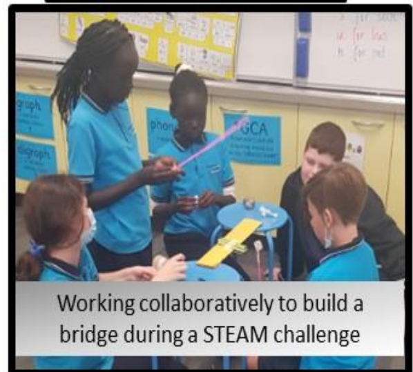
Working collaboratively to build a bridge during a STEAM challenge